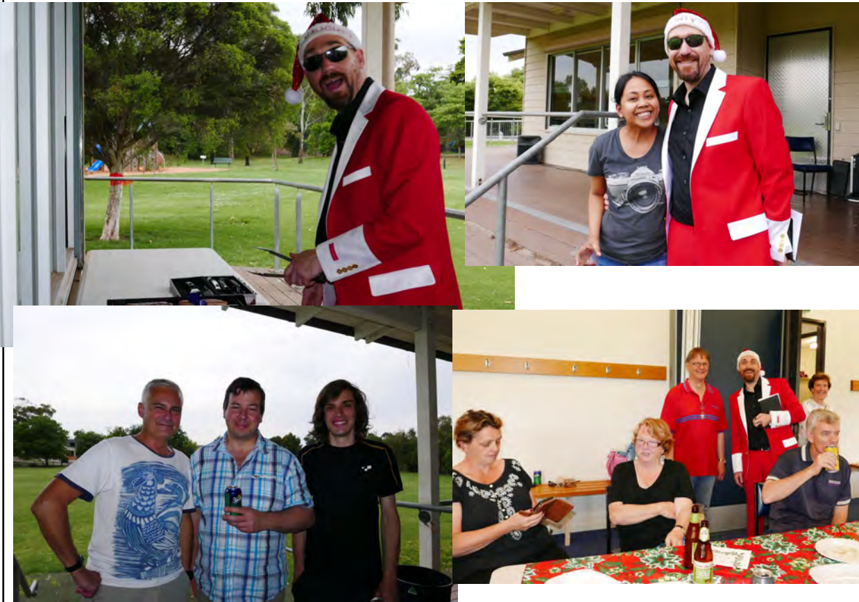
Geelong Revival 2018