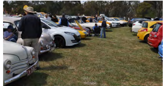
Renault Club vehicles