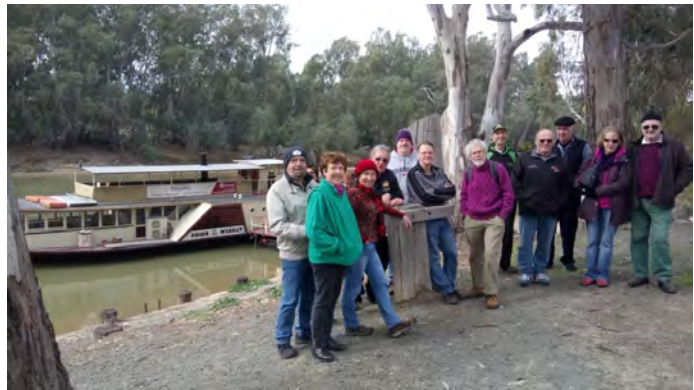
The Pride of the Murray, and the pride of the RCCV, no?