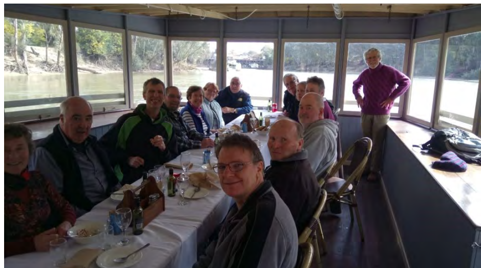
Aboard the Pride of the Murray